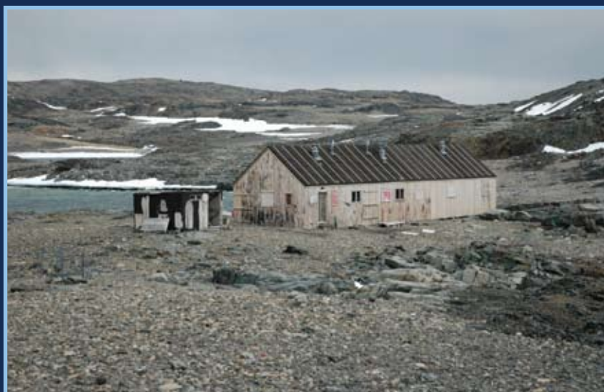
A view of the Hut from the North East with a kennel in the foreground

The rocks at the landing site can be slippery when wet.