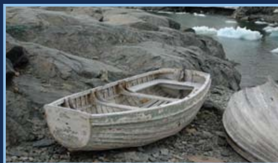
Pram dinghies on the shore of the cove