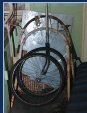
Bicycle wheels used to make sledge meters to measure the distance run