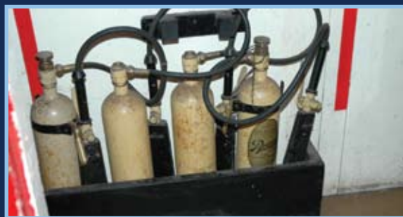
One of several sets of original fire extinguishers