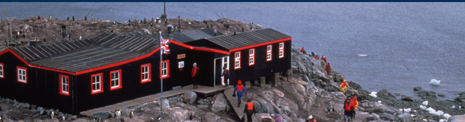
'Base A', Goudier Island, Port Lockroy

64°49'S, 63°29'W - Located in Port Lockroy on the western side of Wiencke Island